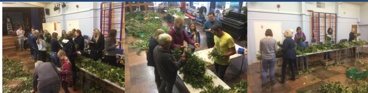
Working hard at the Wreathathon.